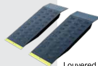
Lowered approach ramps

Challenger's 14,000 lb. closed-front drive-on 4-post lift features a low approach angle and wide runways for easy approach. It also has one of the highest rise in the industry and durable column construction. We designed the 4P14 for versatility, with lowered approach ramps as well as in two lengths. A range of optional accessories can help you accommodate just about anything that comes in for service.